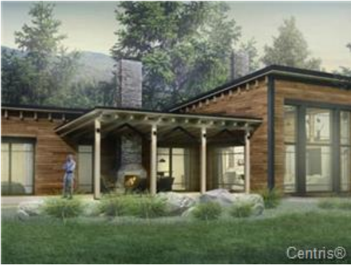
To be built