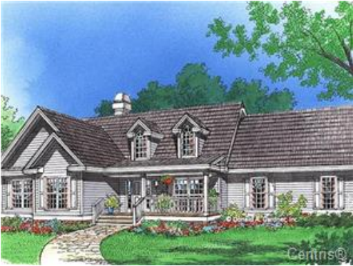
To be built