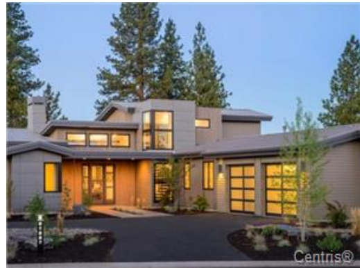
To be built