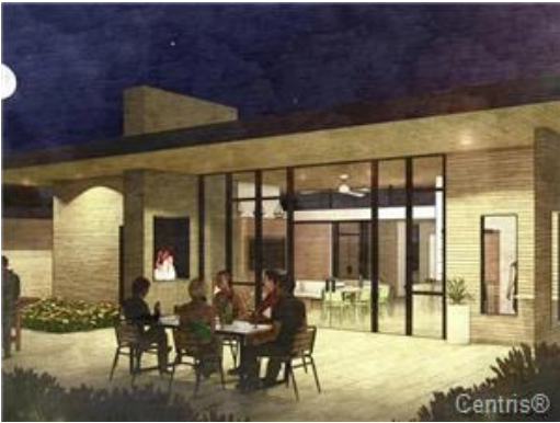
To be built