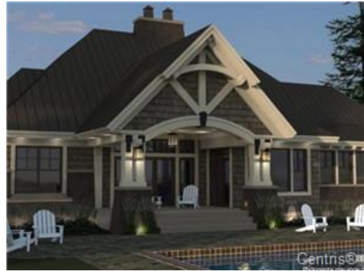
To be built