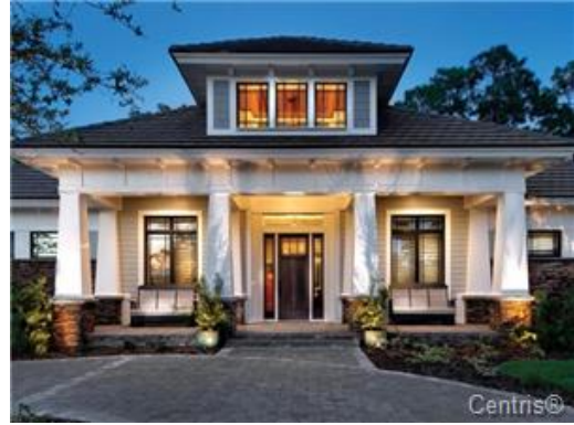
To be built