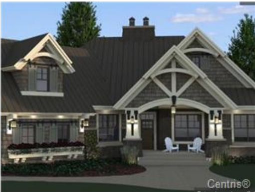
To be built