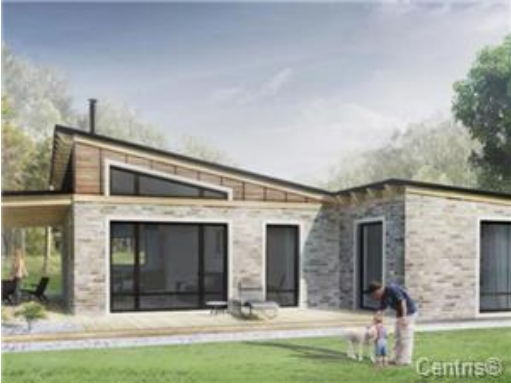
To be built